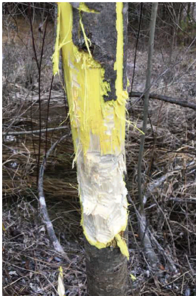
Fig. 1 - The first debarking willow ( Salix sp.) photographed in Tarvisio Forest (Udine Province). 18 th , November, 2018, photo D. Vuerich/CFR (Forestry Service of the Administration of the Region Friuli Venezia Giulia). - Il primo salice ( Salix sp.) scortecciato fotografato nella Foresta di Tarvisio (Udine). 18 novembre 2018, foto D. Vuerich/CFR (Corpo Forestale della Regione Friuli Venezia Giulia).

Friuli Venezia Giulia, photographed a strange deeply debarking willow ( Salix sp.) in the same forest of the Municipality of Tarvisio. From this very close pic (Fig. 1) this debarking seemed could be attributed to ungulate damage, but the field verification of November, 22th, 2018, indicated that they were surely signs of beaver activities.