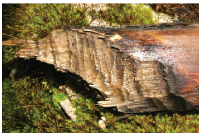
Fig. 2 - Beaver trunk-erosions. Above: fresh erosions; below: older erosions. November, 25 th , 2018, Photo L. Lapini. - Tracce di erosione da castoro. Sopra: erosioni fresche; sotto: erosioni più vecchie. 25 novembre 2018, foto L. Lapini.

scats and footprints) of Tarvisio Municipality, in order to understand both their provenience and their number.