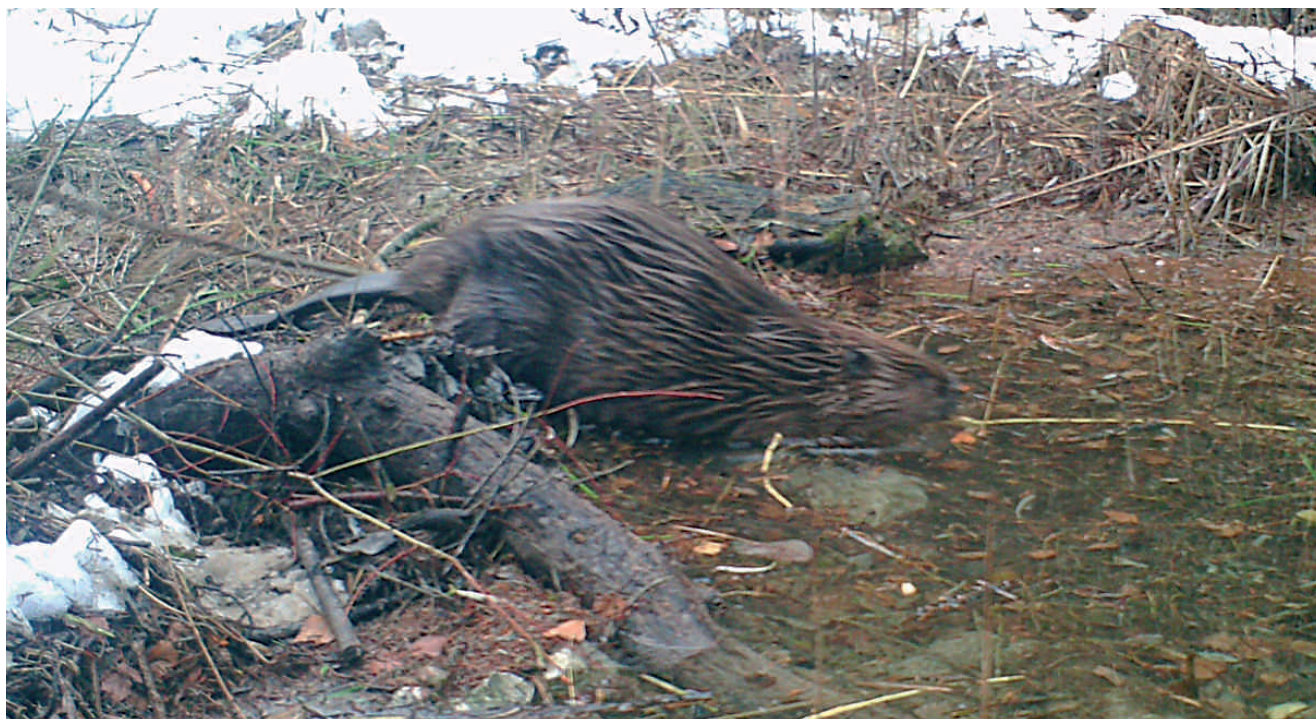
Fig. 4 - Castor fiber from Tarvisio Forest (Udine), November, 22 th , 2018. - Castor fiber nella Foresta di Tarvisio (Udine), 22 novembre 2018.

due to the natural spreading of Austrian reintroduced populations (Fig. 3). At present the first Italian beaver seems to be alone (Fig. 4). This statement seem to be quite sure, since it was never possible to observe signs or photo-trapping records of more specimens together.